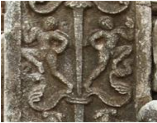
Figure 4.1: Detail of Cupids at the Eastern Vahalkada/ frontispiece of Abhayagiri Stupa