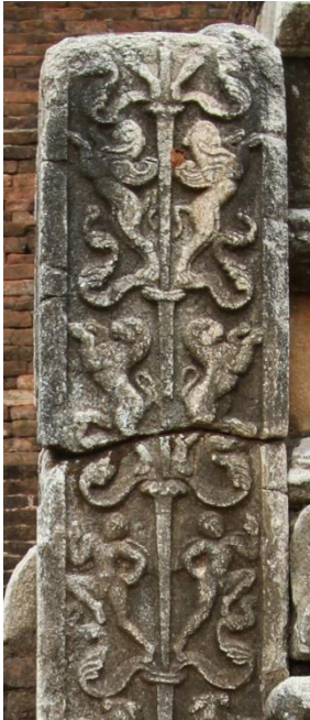
Figure 2: Griffins and Cupids, the Eastern Vahalkada/frontispiece of Abhayagiri Stupa

using several artistic depictions from Ancient Rome. Hence, the researcher tries to show the presence of roman artistic inspirations in a stone pillar that dates back to the Anuradhapura era of ancient Sri Lanka.