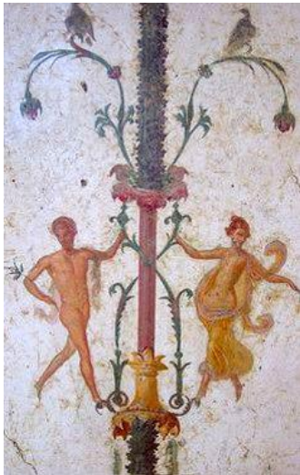
Figure 3: Candelabrum, Painting from Pompeii

First, the motif called candelabrum will be discussed. Candelabrum is the plural of candelabra (Latin), describing the equipment which has been used to hold candles 2 . It is composed of a shaft to hold candles. The candelabrum would have been used in ancient Roman households. The household usage would have necessitated its ubiquitous artistic use in ancient Roman art and architecture. The motif of candelabrum in the paintings of Pompeii (A. Babet, 1999, pp. 76 and 81) are more artistically rendered than that of Abhayagiriya. The refinement of the Roman candelabrum is absent in the motif found at Abhayagiriya though some inspiration owing to Roman tradition is evident. The candelabrum in the paintings of Pompeii is more intricate, sometimes with female representations (Fig. 3).