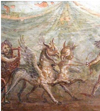
Figure 5.2: Detail of Griffins, Painting from Pompeii, National Archaeological Museum, Naples