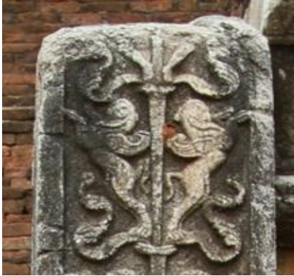
Figure 5.1: Detail of Griffins at the Eastern Vahalkada/frontispiece of Abhayagiri Stupa