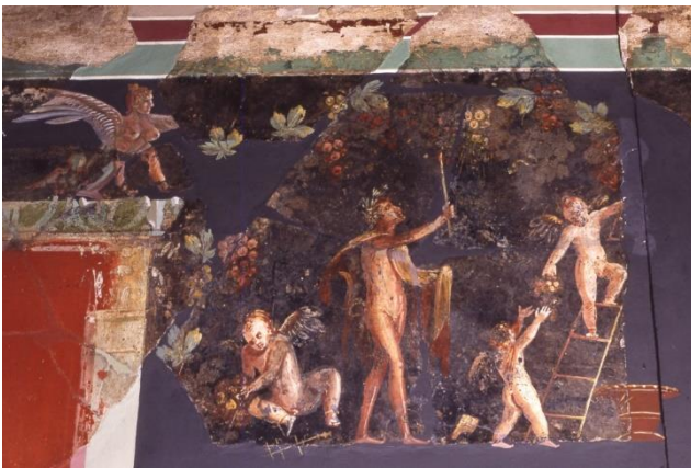
Figure 4.2: Cupids, Painting from Pompeii National Archaeological Museum, Naples

As the third element, the motif of griffins will be discussed. The column under discussion at the Eastern Vahalkada/ frontispiece of Abhayagiri Stupa depicts a pair of griffins, turned in opposite directions with their forelimbs raised. They appear at the uppermost section of the candelabrum (Figure 5.1). The griffins are winged lion-like figures with heads of birds. The word griffon, griffin or gryphon has been derived from Latin gryphu . According to Stephen Friar, “Griffin of the animals in mythology the griffin or gryphon is the most magnificent. The lion is the king of the beasts and the eagle the king of the birds, but in the griffin the majesty of the two creatures is joined together. Its head, wings and talons are those of an eagle, to which are added a pair of sharp ears, as it has very acute hearing. Its body, hindquarters and tail are